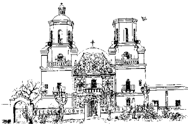
Mission San Xavier del Bac

Padre Kino is one of the world's greatest missionaries. Before he began his work in the New World, Padre Kino was a brilliant scholar and professor in Europe.