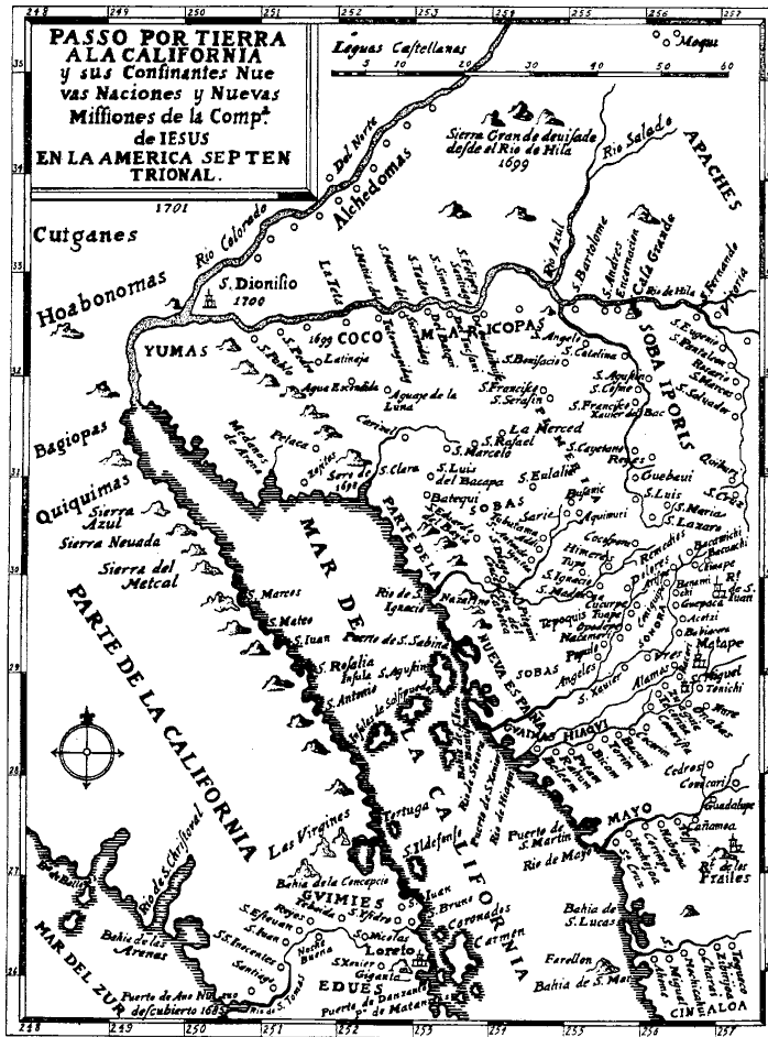
The Sonoran Desert and Its People 1701 Map Drawn By Padre Eusebio Francisco Kino, S.J.

The Kino Heritage Society supports Padre Kino's Cause for Saint-hood as it engages in activities that honor Padre Kino and brings together people in the spirit of fellowship and service. You can learn more about the life and legacy of Padre Kino at The Kino Heritage Society's web site at www.padreokino.com and read online or download the book "Padre Kino and The Trail to the Pacific."